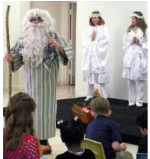
Moses tells the people of the Ten Commandants

L ooking ahead, we'll spend January and early February covering The Beatitudes. As parents, here's what you can do to reinforce what is being taught on Sunday mornings: