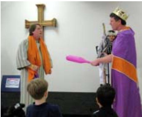
Moses tells Pharaoh to let his people go

For those of you who were wondering how Pumpkin, our pregnant donkey, is doing: labor was quite long as she didn't give birth until 12/26! Mom and baby are doing well.