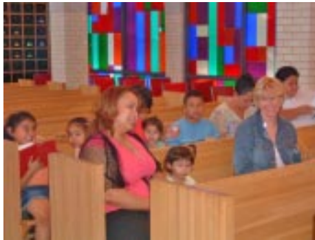
Part of the Congregation