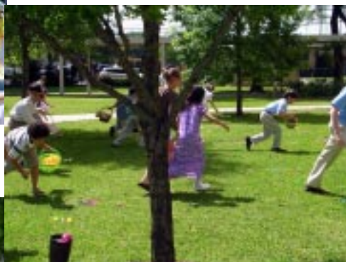
Egg Hunt – The Race Is On!