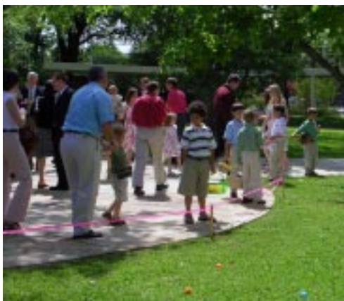
Egg Hunt – At the Starting Gate