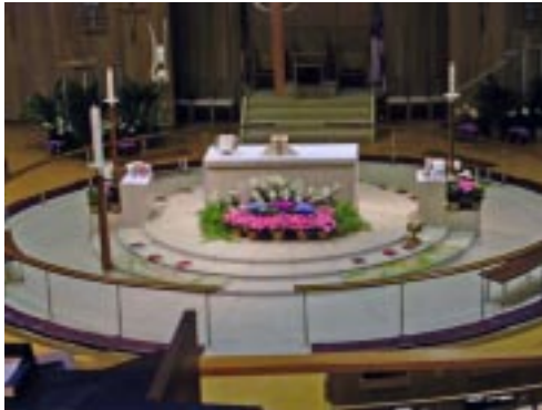
The Easter Altar