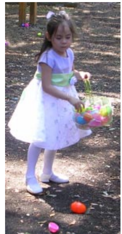
Egg Hunt – Which Is the Best?